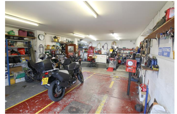
BASEMENT 2015 sq.ft. (187.2 sq.m.) approx.

IMPORTANT: we would like to inform prospective purchasers that these sales particulars have been prepared as a general guide only. A detailed survey has not been carried out, nor the services, appliances and fittings tested. Room sizes should not be relied upon for furnishing purposes and are approximate. If floor plans are included, they are for guidance only and illustration purposes only and may not be to scale. If there are any important matters likely to affect your decision to buy, please contact us before viewing the property. All offers should be submitted in writing to CLL Property Ltd with whom the purchasers should register their interest if they wish to be advised of a closing date.