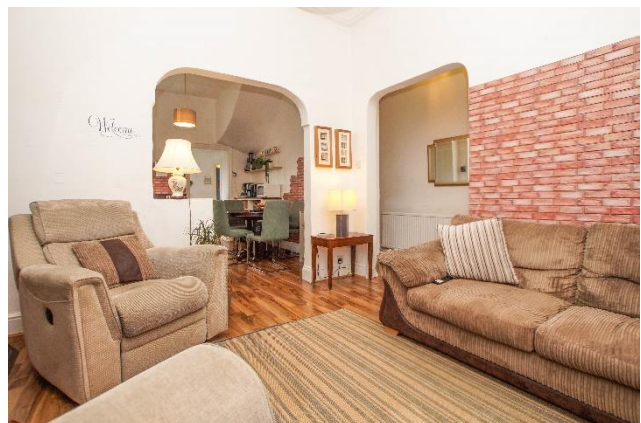
OPEN PLAN LOUNGE AREA