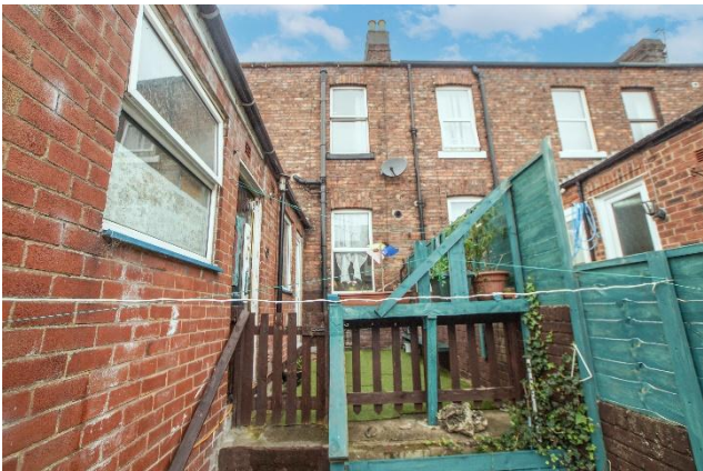
REAR TIERED GARDEN

TENURE We are informed the tenure is Freehold.