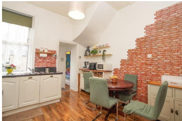
OPEN PLAN DINING KITCHEN AREA

INNER HALLWAY Frosted double glazed UPVC door to the side leading to the garden and door to the ground floor bedroom.