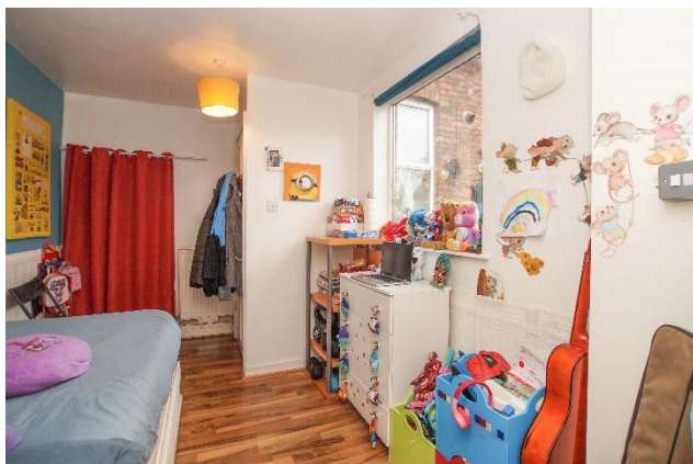
GROUND FLOOR BEDROOM

EN-SUITE BATHROOM (8'5 x 5'5) Three piece suite comprising WC, sink with tiled splashback and panelled bath. Frosted double glazed UPVC window to the side, radiator and tile effect vinyl flooring.