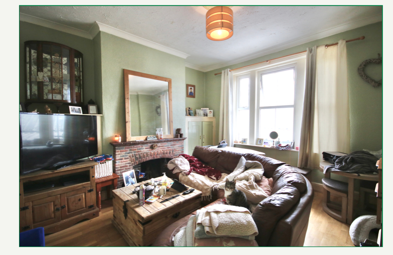
Rockfield Road, HR1 2UA Guide Price £625,000

Close proximity to the County Hospital and train station