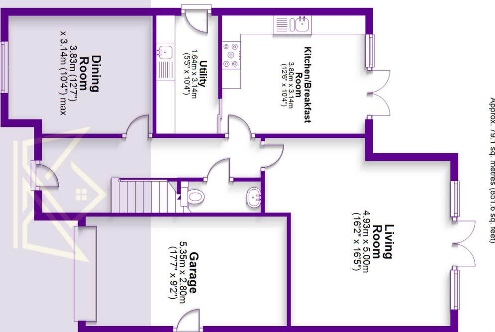
Ground Floor Approx. 79.1 sq. metres (851.6 sq. feet)