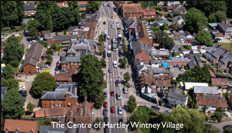
The Centre of Hartley Wintney Village

Nearby larger shopping experiences can be found in Fleet, Camberley and Basingstoke.