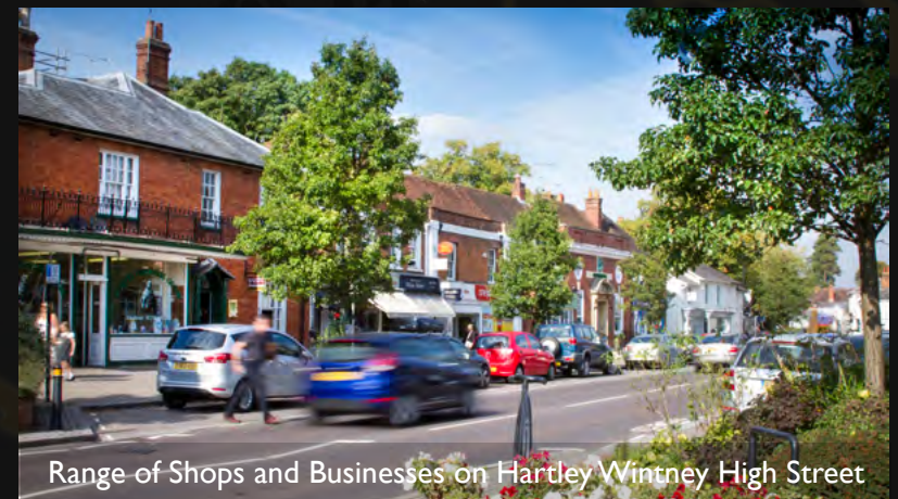
Range of Shops and Businesses on Hartley Wintney High Street