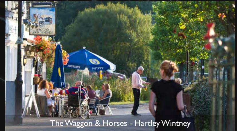
The Waggon & Horses - Hartley Wintney