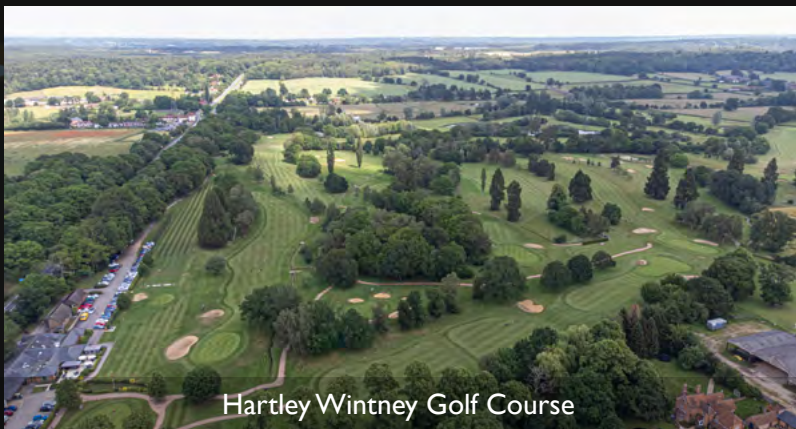
Hartley Wintney Golf Course