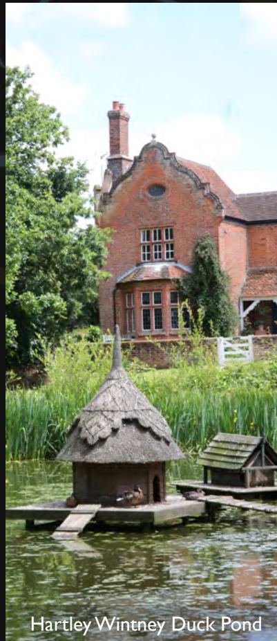
Hartley Wintney Duck Pond