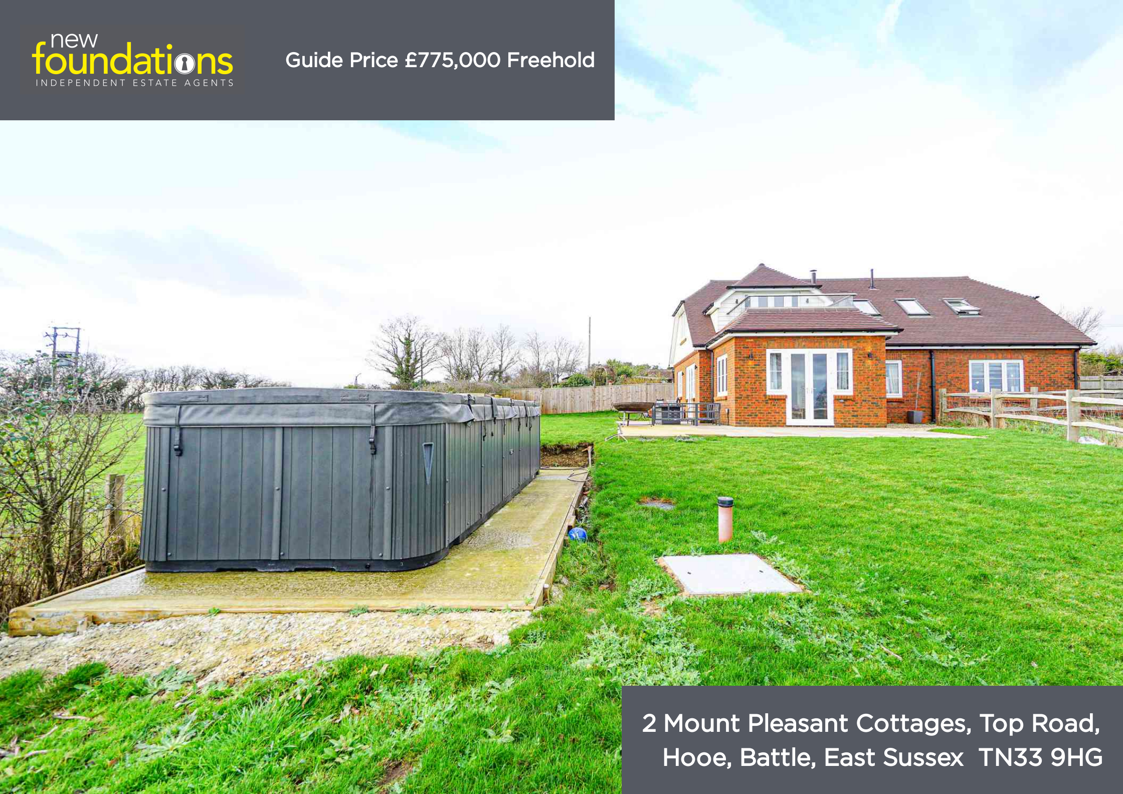
2 Mount Pleasant Cottages, Top Road, Hooe, Battle, East Sussex TN33 9HG