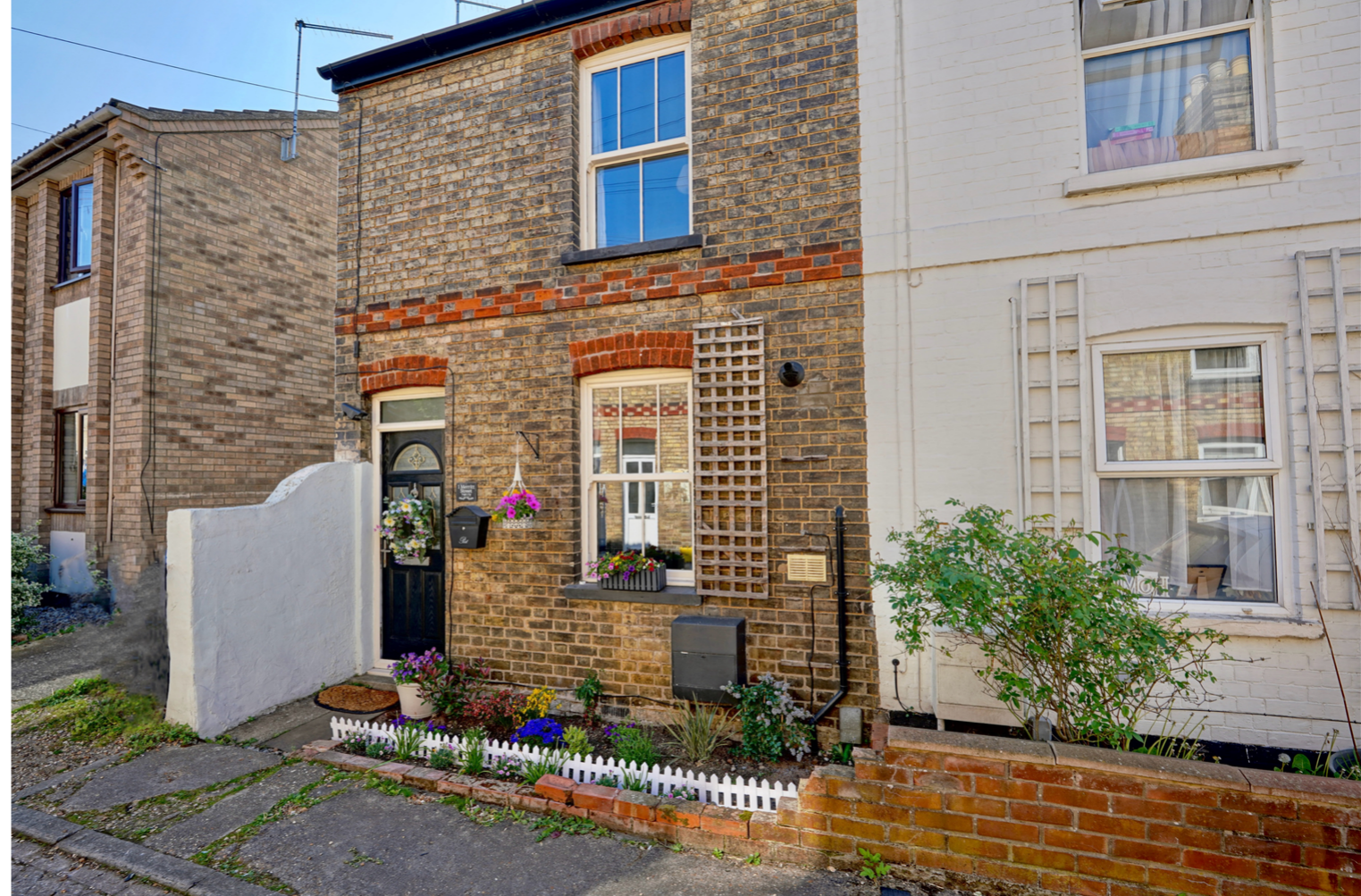
1 Merritt Street, Huntingdon PE29 3HF