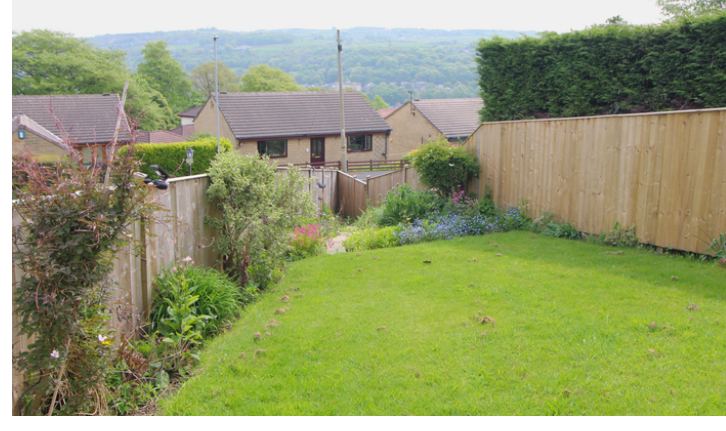
16 Oak Bank Crescent, Oakworth, Keighley, West Yorkshire, BD22 7SZ