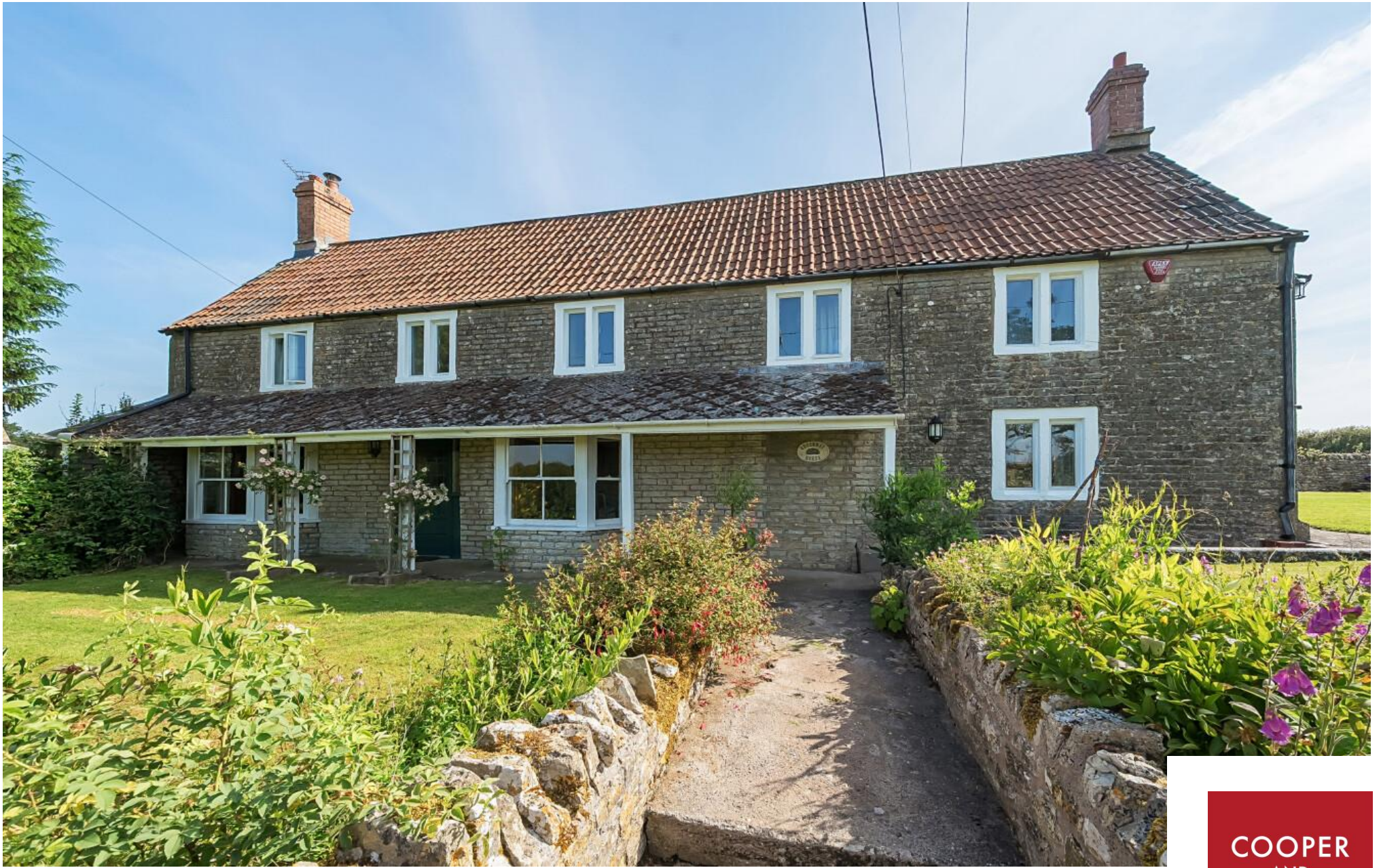
Greenway House, Litton Lane, Hinton Blewett BS39 5AY