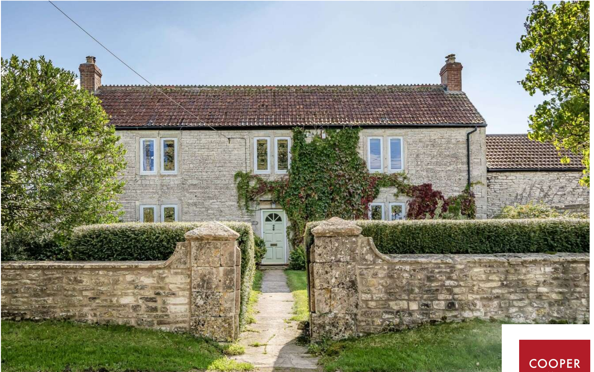
Manor Farm, Clapton, Midsomer Norton BA3 4EB