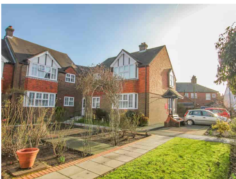
Flat 24 Wellington Court Rue de Bayeux, Battle. TN33 0EB. £169,950 leasehold

An opportunity to acquire this two bedroom ground floor retirement apartment on the popular Rue De Bayeux development just a moments walk from Battle High Street. Offered with no onward chain.