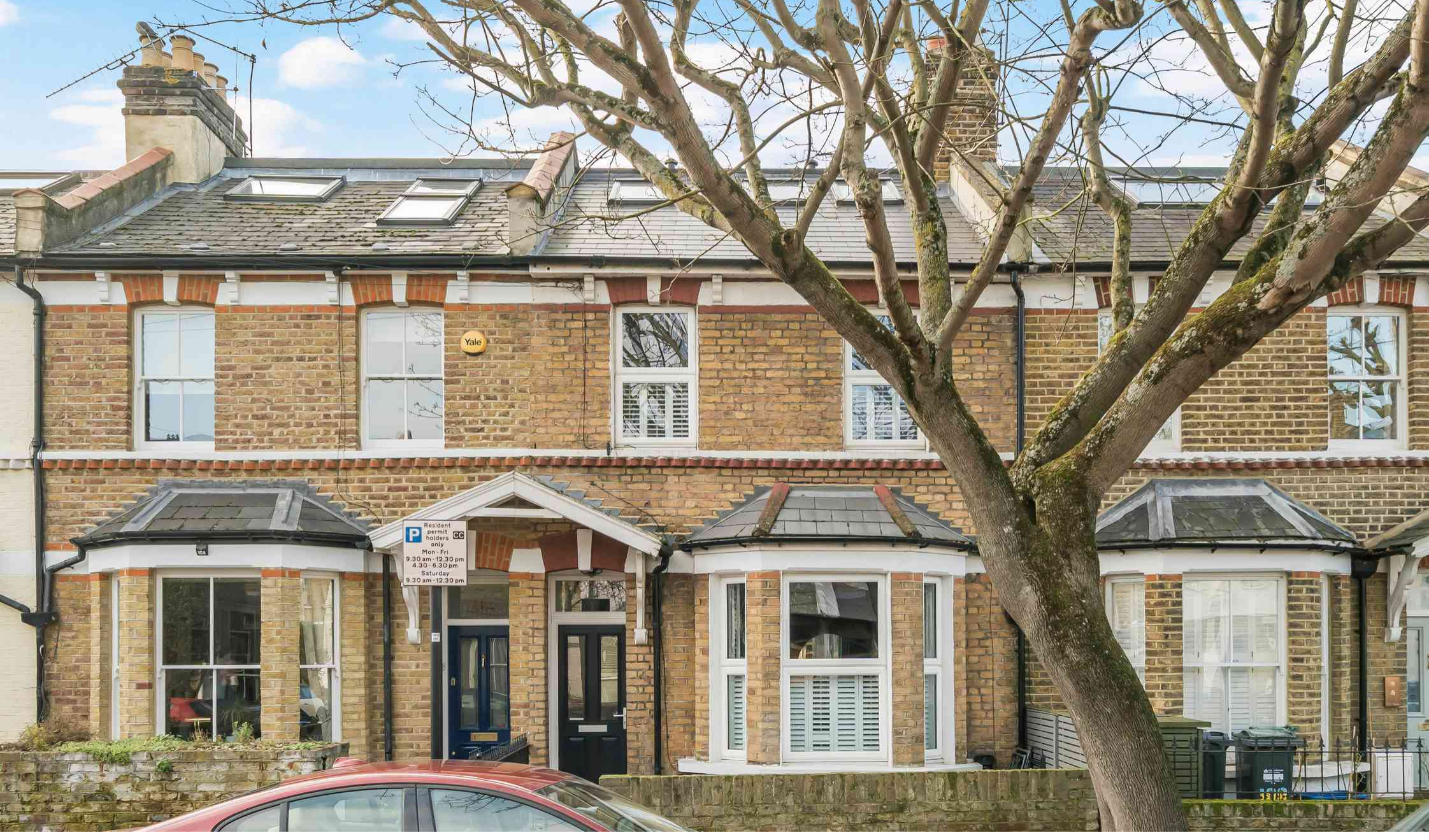
Duke Road, London, W4 2DF