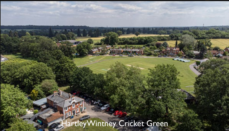
Hartley Wintney Cricket Green