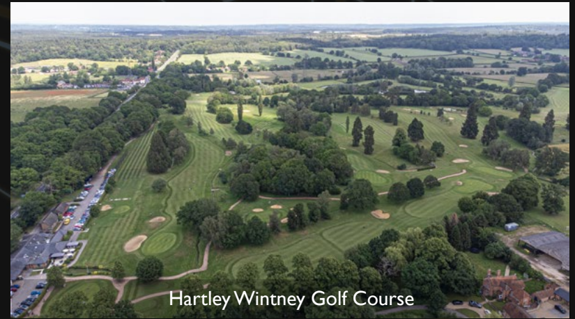
Hartley Wintney Golf Course