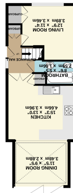
GROUND FLOOR 735 sq ft (68.2 sq m) approx.

What every attempt has been made to ensure the accuracy of the floorplan contained here, measurements of doors, windows, rooms and any other items are approximate and no responsibility is taken for any error, omission or mis-statement. This plan is for illustrative purposes only and should be used as such by any prospective purchaser. The services, systems and appliances shown have not been tested and no guarantee as to their operability or efficiency can be given. Made with Metreox 5/2021