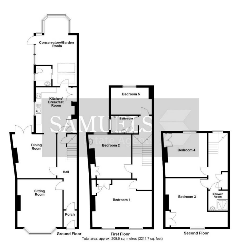
Floor plan for illustration purposes only - not to scale