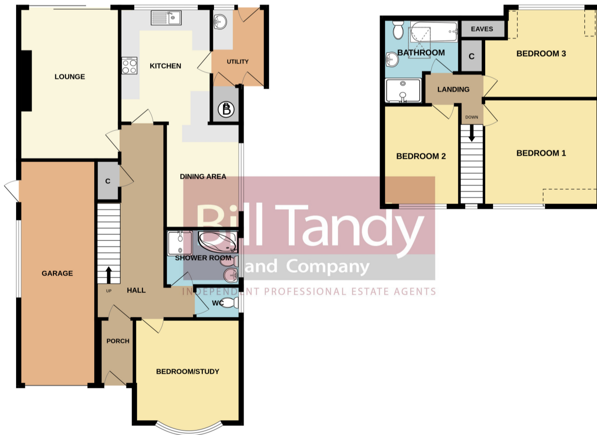
1ST FLOOR 534 sq.ft. (49.6 sq.m.) approx.

TOTAL FLOOR AREA: 1677 sq.ft. (155.8 sq.m.) approx.