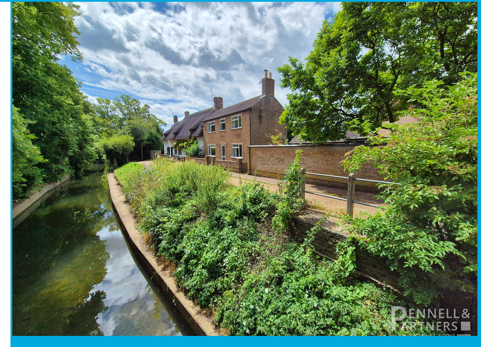
1 THE BOWER, WHITTLESEY, PETERBOROUGH, CAMBRIDGESHIRE. PE7 1EQ