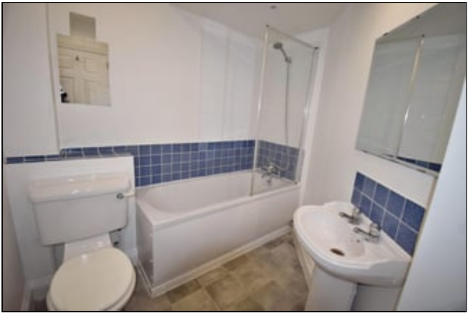
7' 2" x 7' 7" (2.18m x 2.31m) Panelled bath with overhead shower, pedestal wash hand basin, low level W.C., localised tiling and extractor fan.

There is a small walled area of garden to front with a gate leading to front door.