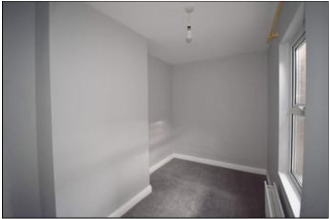
6' 10" x 12' 7" (2.08m x 3.84m) Double glazed window to side and a radiator.