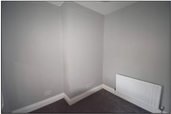
7' 8" x 7' 6" (2.34m x 2.29m) Double glazed window to rear, looking out to the garden, and a radiator.