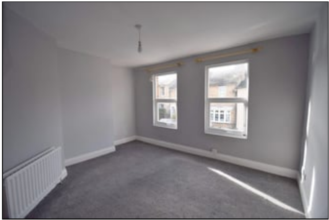
11' 6" x 13' 7" (3.51m x 4.14m) A bright and spacious master, with two double glazed windows to the front and a radiator.