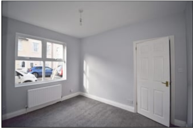
9' 11" x 11' 8" (3.02m x 3.56m) Window to front, radiator.

3' 3" x 12' 5" (0.99m x 3.78m) Door to lounge, open to dining room.