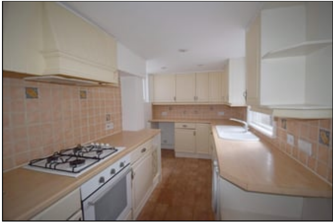
6' 7" x 12' 8" (2.01m x 3.86m) Cream wall and base units with wood effect worktops, Plastic 1 1/2 bowl sink unit, plumbed for washing machine, gas hob, electric over, extractor hood, part tiled walls, windows to sides, wine rack, tiled floor and space for fridge/freezer.