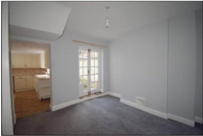
11' 8" x 13' 8" (3.56m x 4.17m) French doors to garden, radiator, convenient under-stairs storage cupboard. Opens through to the kitchen.