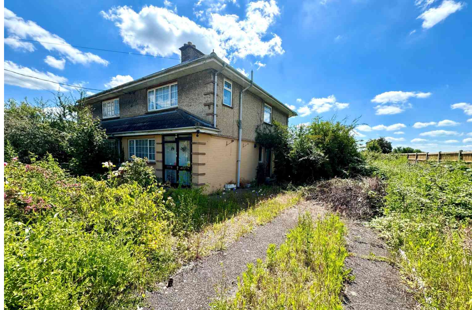
School Lane, Conington CB23 4LP £275,000