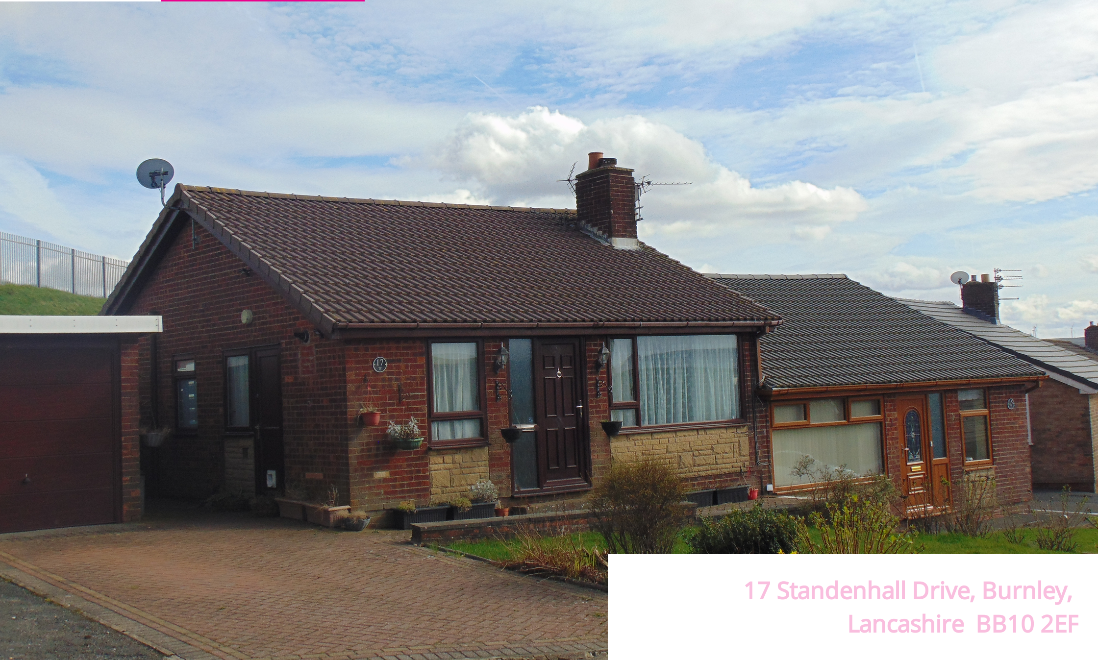
17 Standenhall Drive, Burnley, Lancashire BB10 2EF