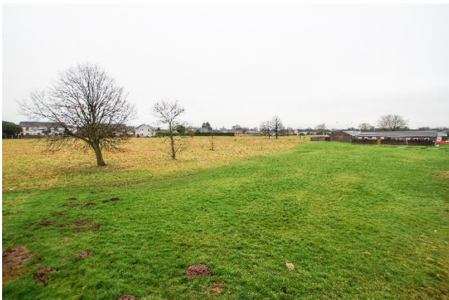
VIEW FROM REAR GARDEN