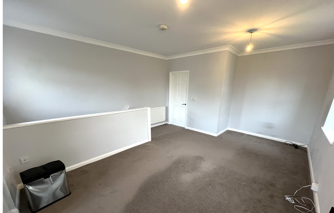
9b Feltham Road, Ashford, Surrey TW15 1DQ £189,950 - Leasehold