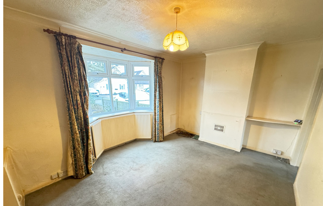
22 Doris Road, Ashford, Surrey TW15 1LR £370,000 - Freehold