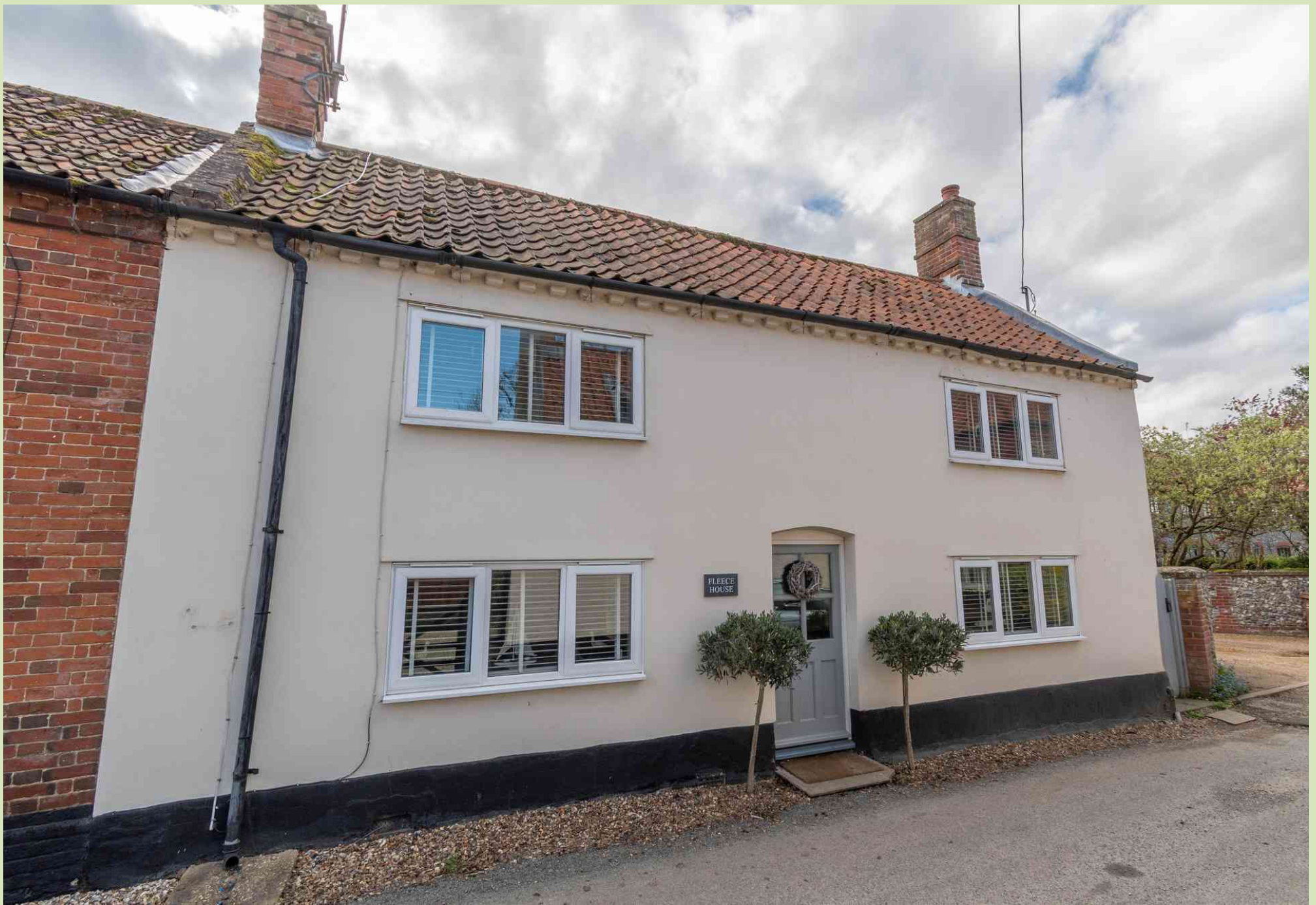
Fleece House, South Creake Guide Price £400,000