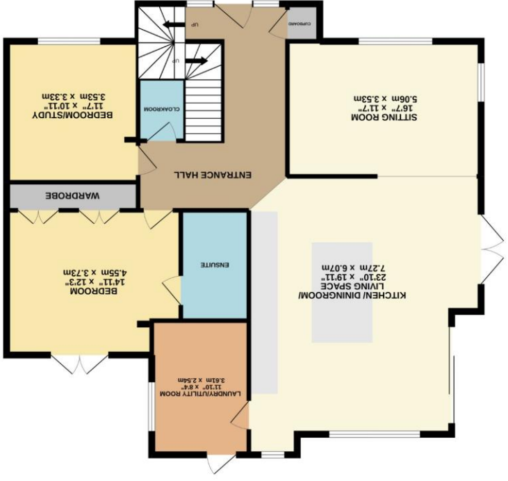
1ST FLOOR (61.2 sq.m.) approx.