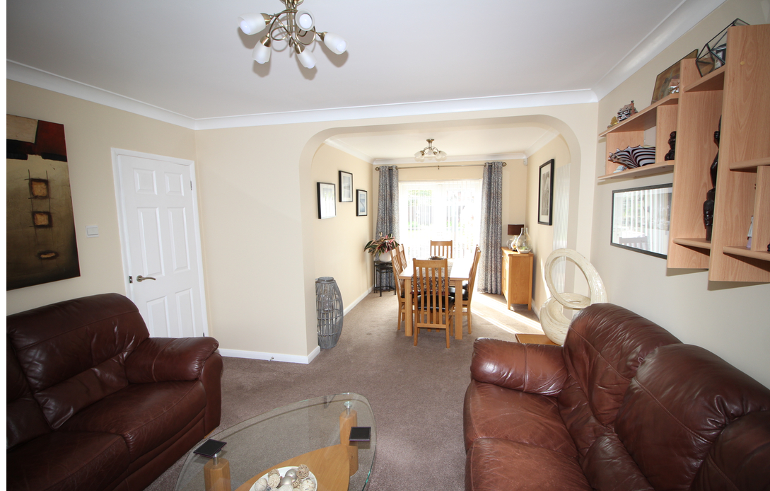
24 Carew Road, Ashford, Surrey TW15 1JQ £539,950 - Freehold