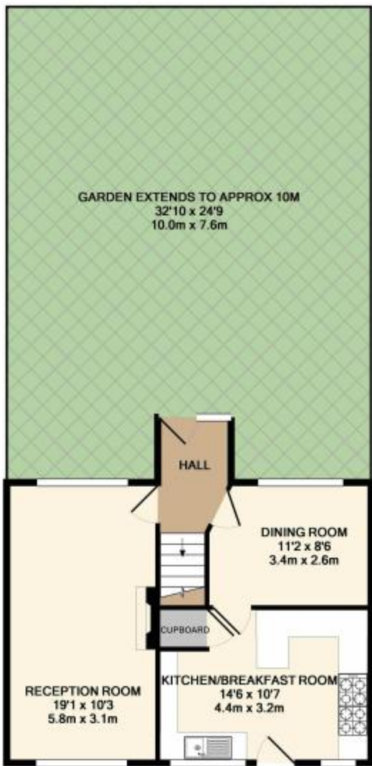
GROUND FLOOR APPROX. FLOOR AREA 494 SQ.FT. (45.9 SQ.M.)

This delightful Three / Four bedroom home situated in the popular leafy village of Northaw with exceptional panoramic views over countryside to the rear of the home. The family home consists dual aspect lounge, kitchen breakfast room and fourth bedroom on the ground floor. The first floor benefits from two double bedrooms with spectacular open countryside views, one single bedroom, plus a family bathroom with separate WC.