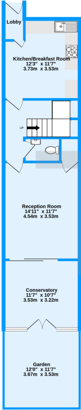
Ground Floor 555 sq.ft. (51.6 sq.m.) approx.