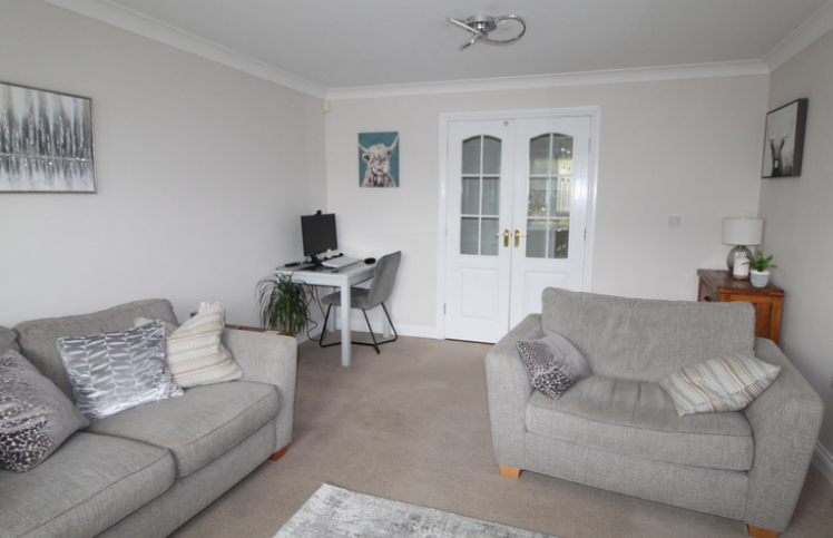
10 Main Street, Wilsden, Bradford, West Yorkshire, BD15 0EJ