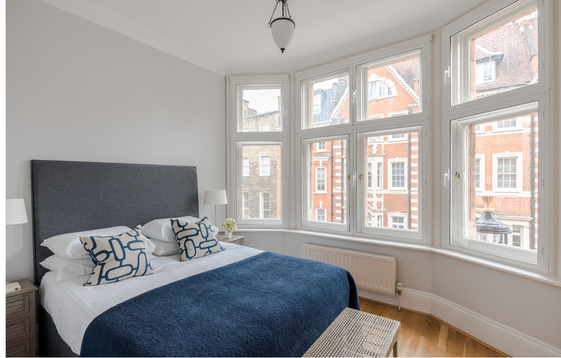
Flat 5, 29 Wimpole Street, Marylebone, London, W1G 8GP £1,750,000 -