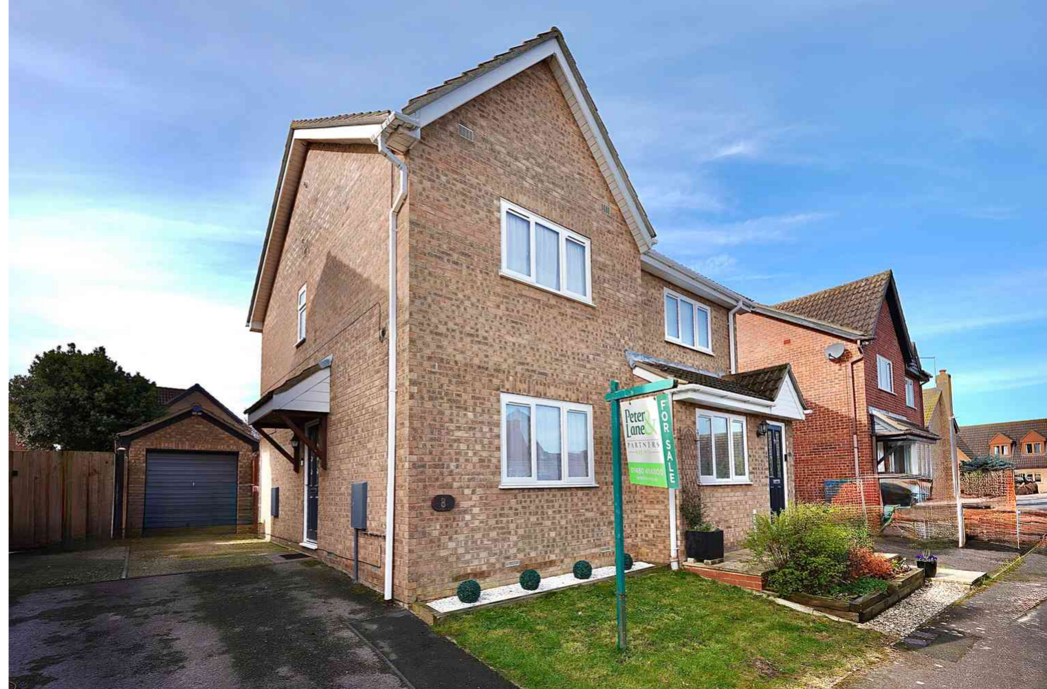
Grange Close, Sawtry PE28 5NA