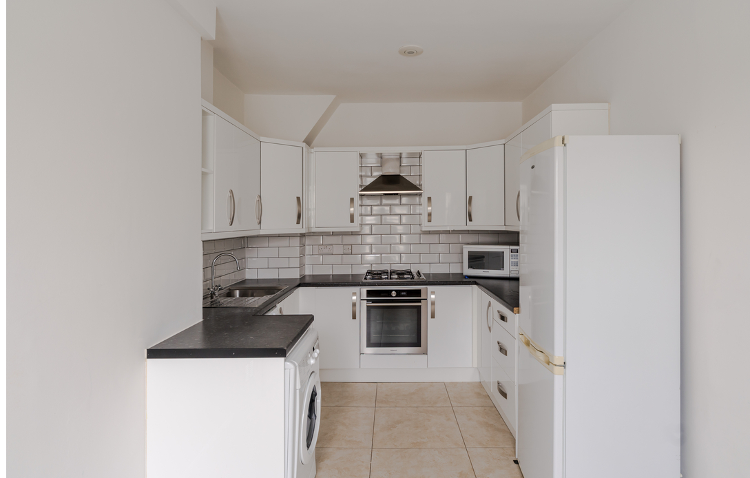
Flat 11, 26 Bryanston Square, Marylebone, London, W1H 2DS £850 p/w