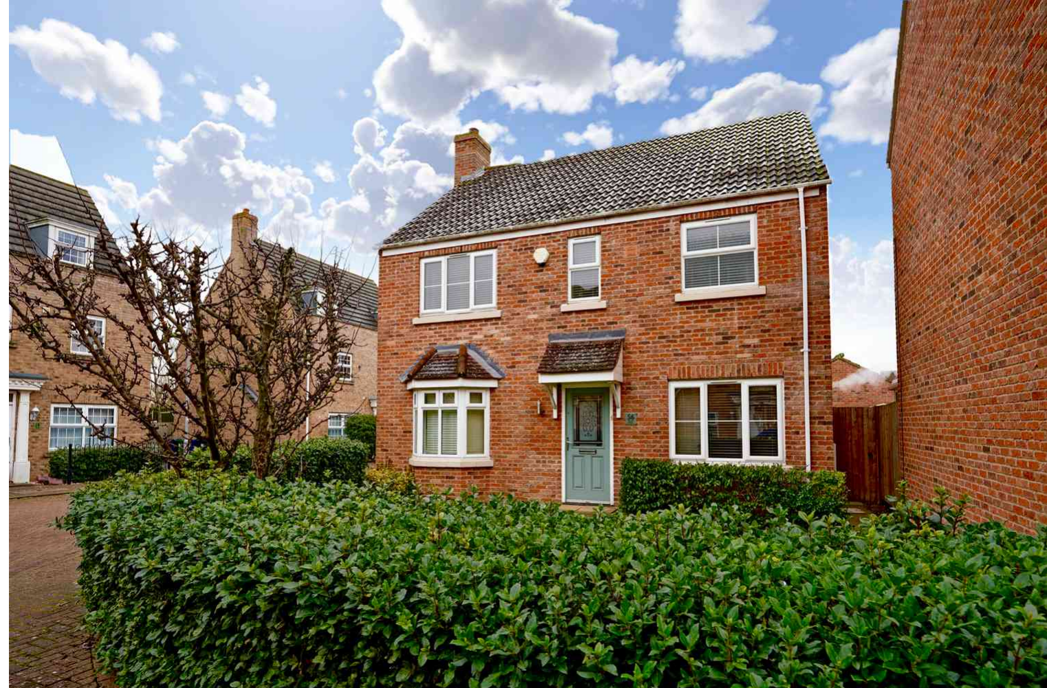
Howell Drive, Sapley PE28 2GD Guide Price £395,000