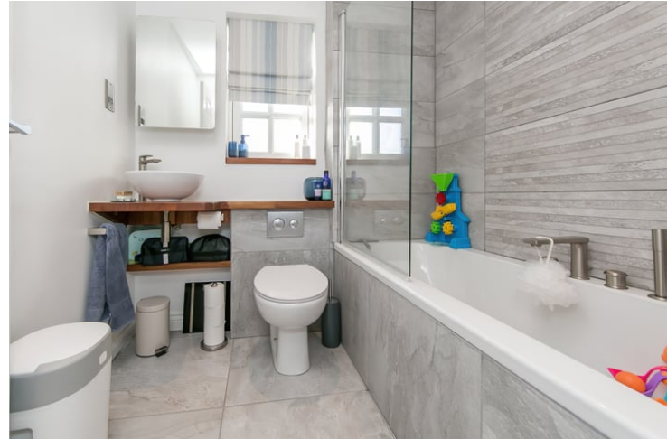
Obscured double glazed timber sash window to rear, tiled floor heated towel rail, inset spot lights, close coupled WC, wash hand basin with solid wood counter top, tiled panelled bath with over head shower and separate pull out hand shower head.