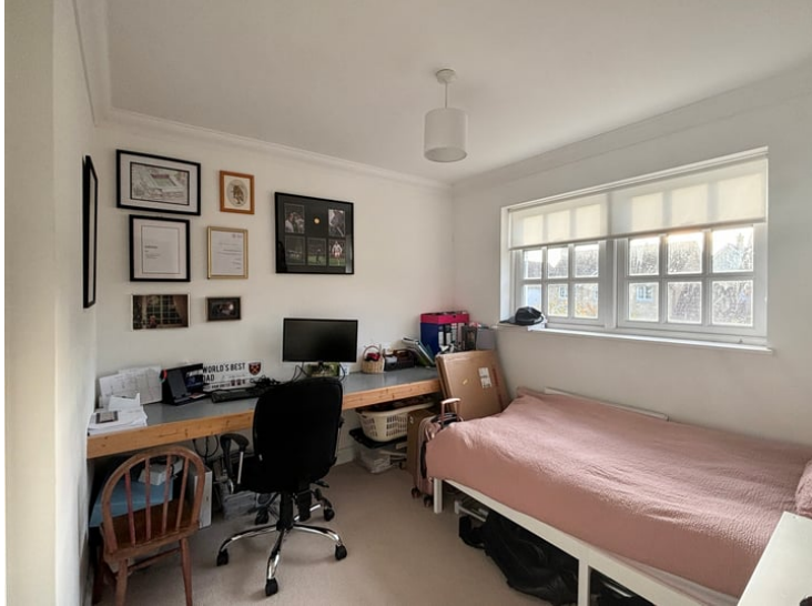
9' 10" x 8' 11" (3.00m x 2.72m) With window to rear, radiator, built in wardrobe.