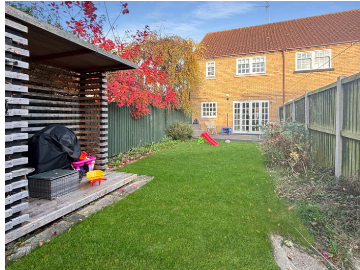
A well maintained south/west facing garden enclosed by privacy fencing with a lawn area leading to a raised decking area with space for outdoor dining furniture, a paved space to the rear allowing a further patio area or hard standing for shed, timber clad storage unit, two silver birch trees and shrubs.