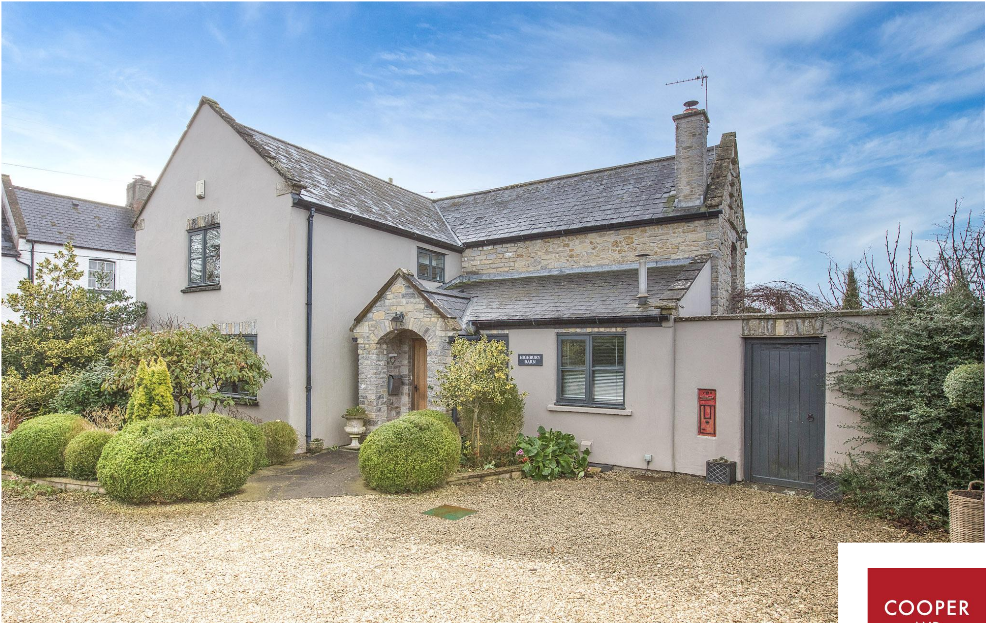
Highbury Barn, West Stoughton, Wedmore BS28 4PW