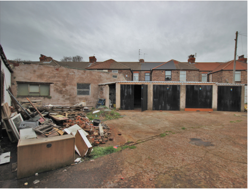
Workshop Twelve Lock-up Garages