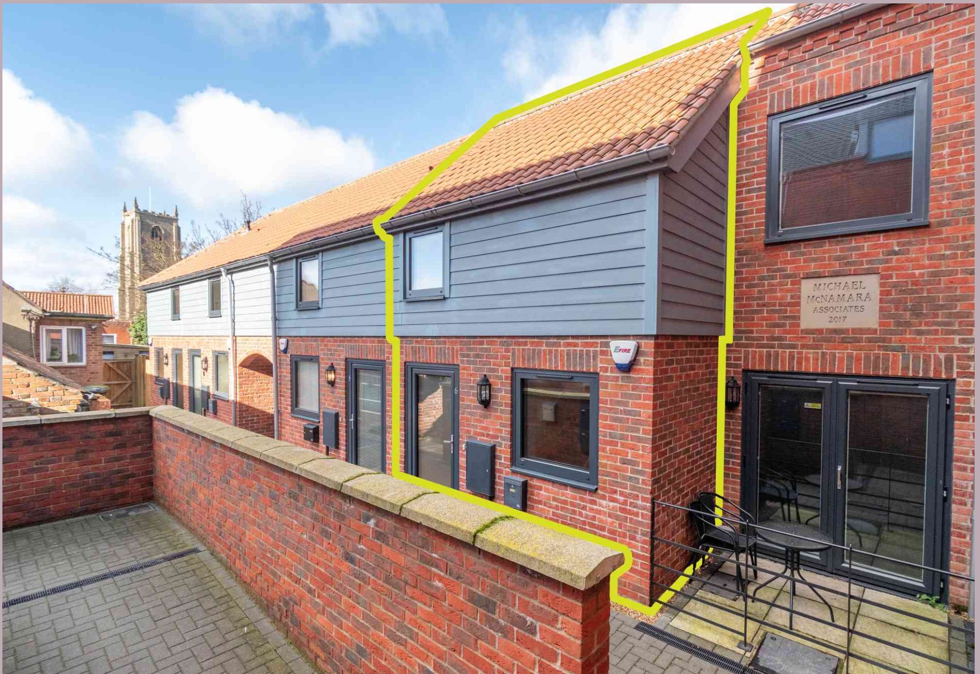
6 Newmans Court Norwich Street, Fakenham £750 per calendar month