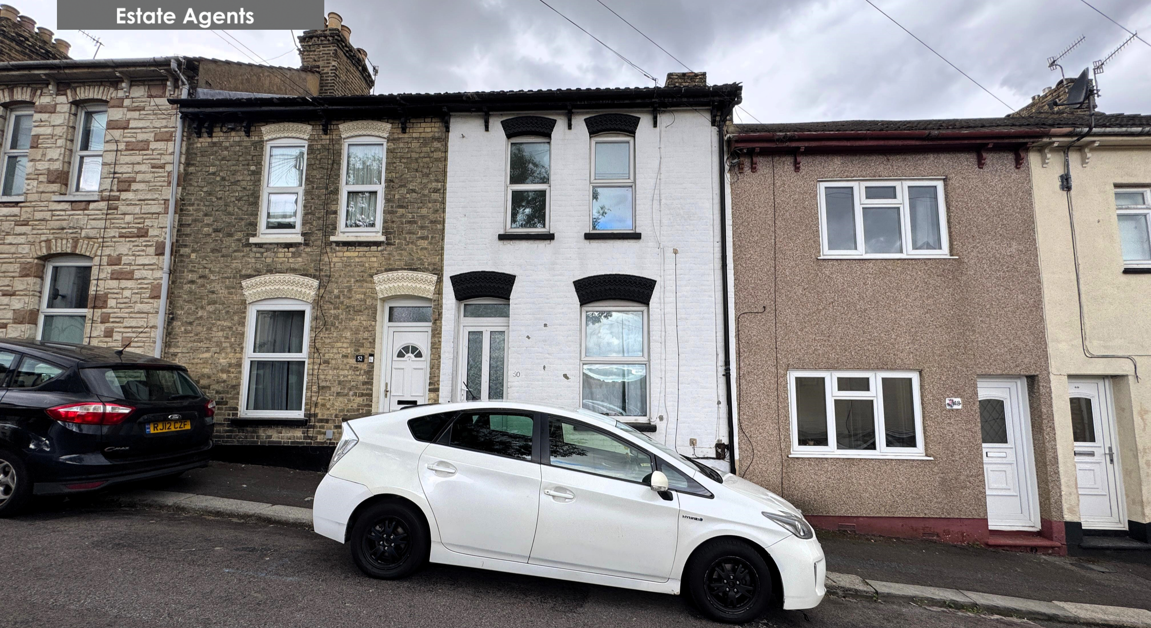
Two Bedroom Terraced House Melbourne Road, Chatham, Kent, ME4 5PB