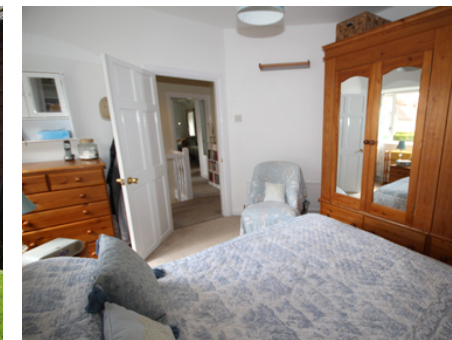
165 Jackmans Place, Letchworth Garden City, Hertfordshire, SG6 1RG