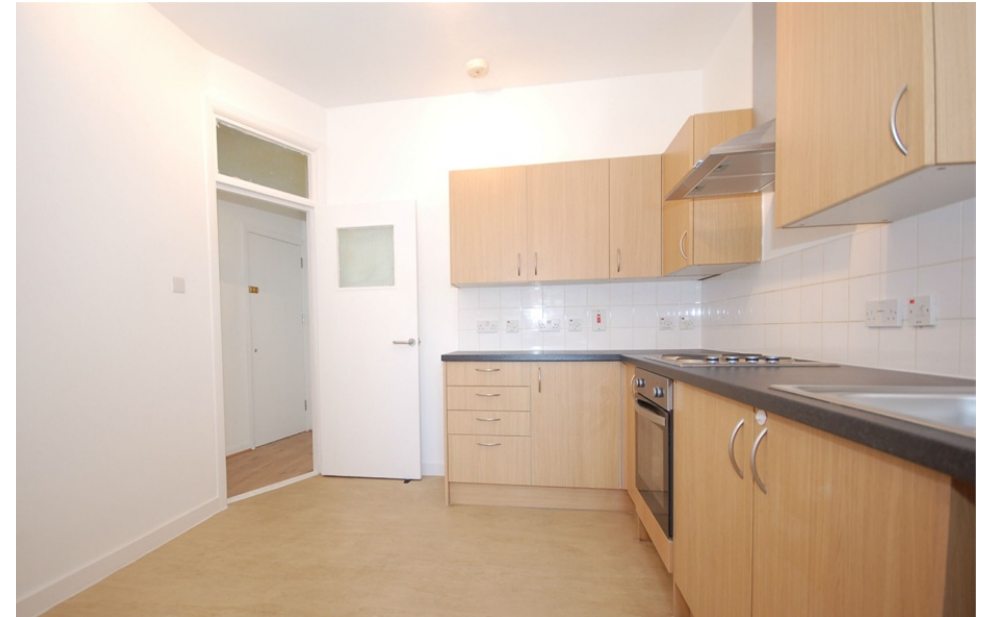
Redfern Road, Harlesden, London NW10 9LB £305,000 - Leasehold