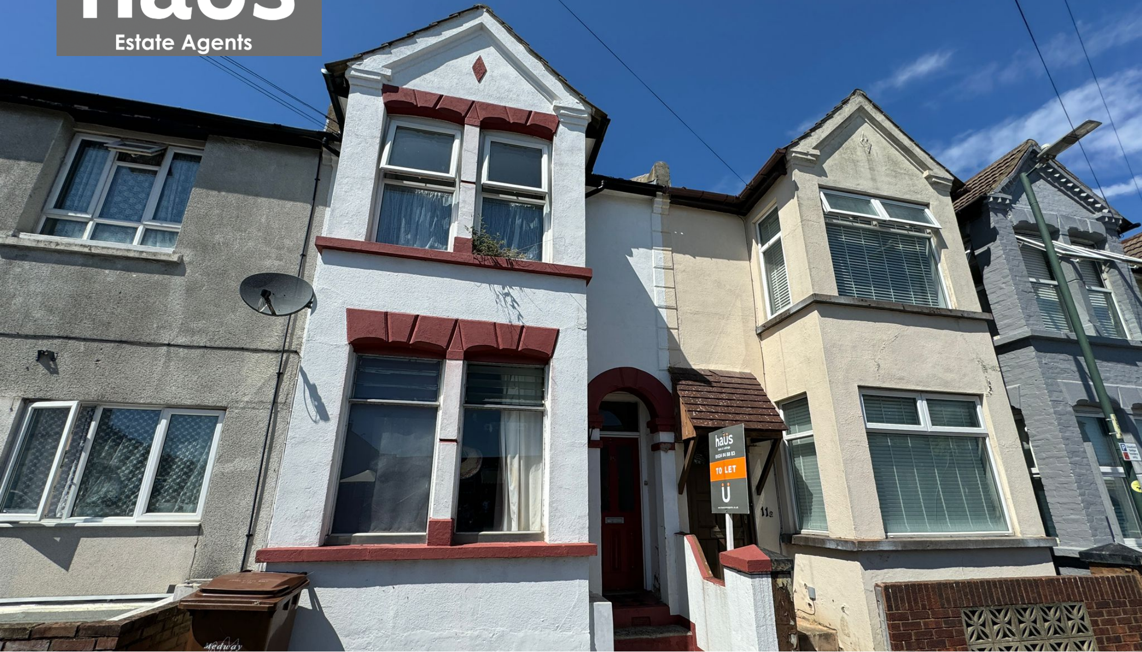
One Bedroom Terraced House Byron Road (Top Floor), Gillingham, Kent, ME7 5XX