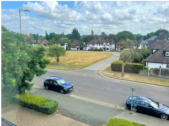
Private Roof Terrace