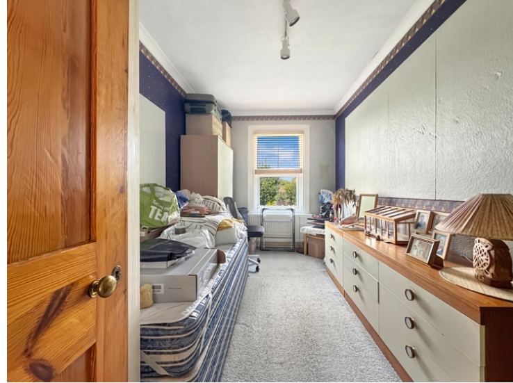
13' 8" x 8' 2" (4.17m x 2.49m) Window to rear, radiator, fitted airing cupboard.