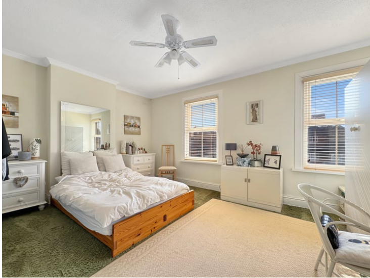
16' 2" x 12' 2" (4.93m x 3.71m) Two windows to front, radiator.