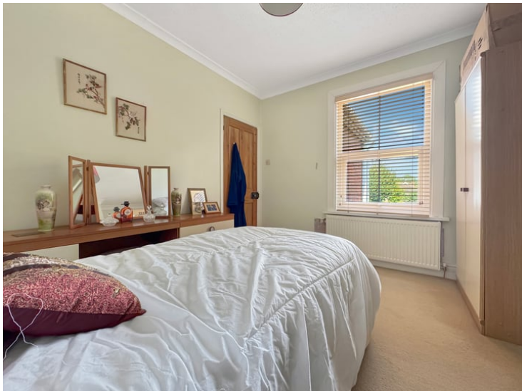
11' 4" x 10' 3" (3.45m x 3.12m) Window to rear, radiator.