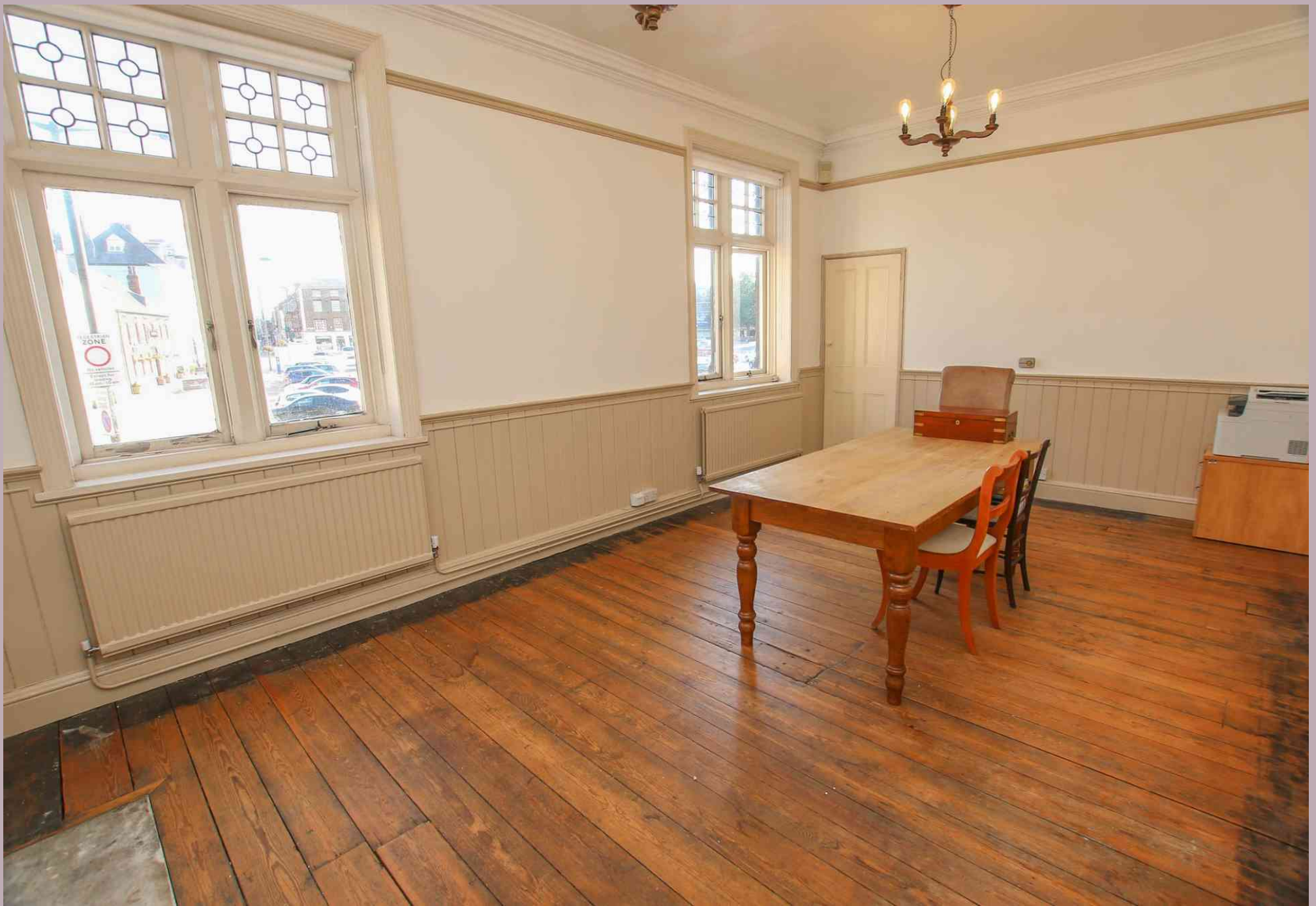
First Floor Office, 14 Tuesday Market Place, King's Lynn £4,800 PER Annum