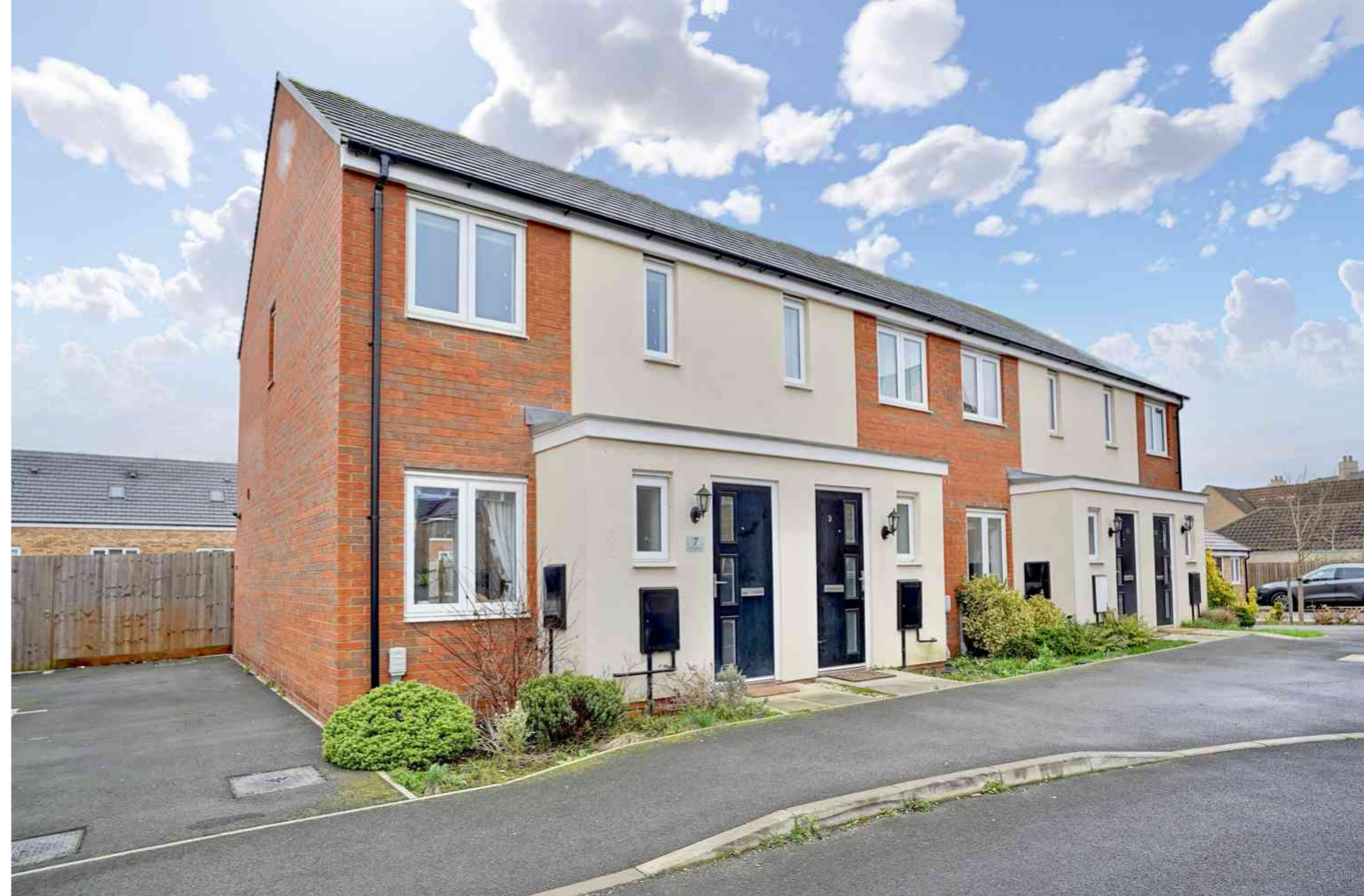
Bloomfield Drive, Hinchingsbrooke Park PE29 6LD