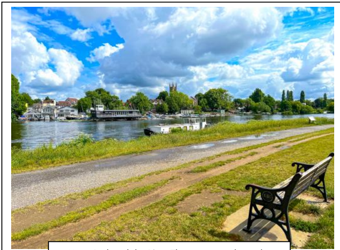
Hurst Park and the River Thames towpath nearby