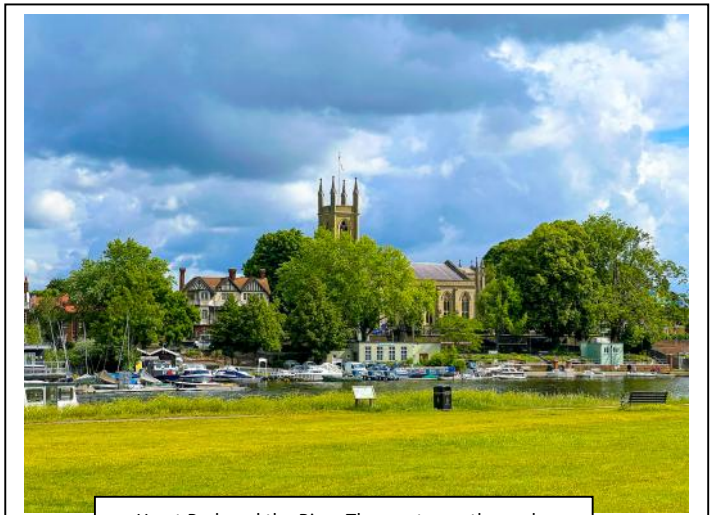
Hurst Park and the River Thames towpath nearby