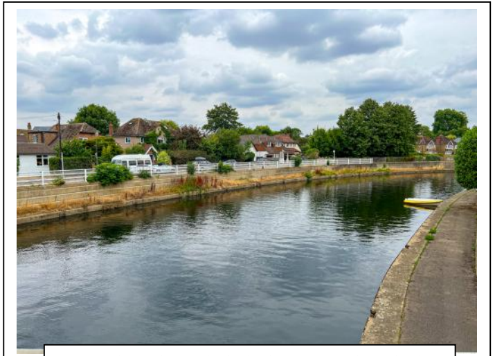
River Ember pedestrian bridge leading to East Molesey closeby