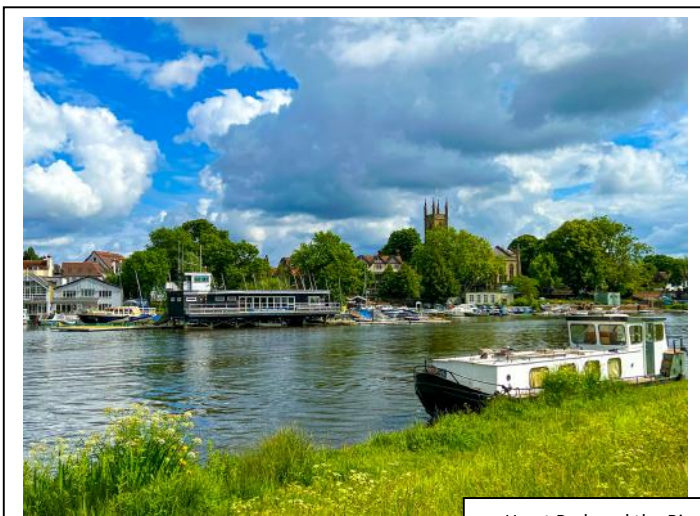
Hurst Park and the River Thames towpath nearby