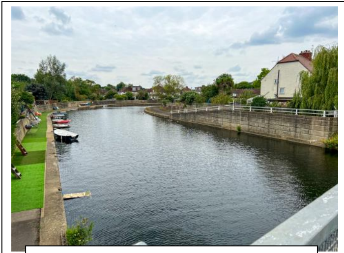
River Ember pedestrian bridge leading to East Molesey closeby