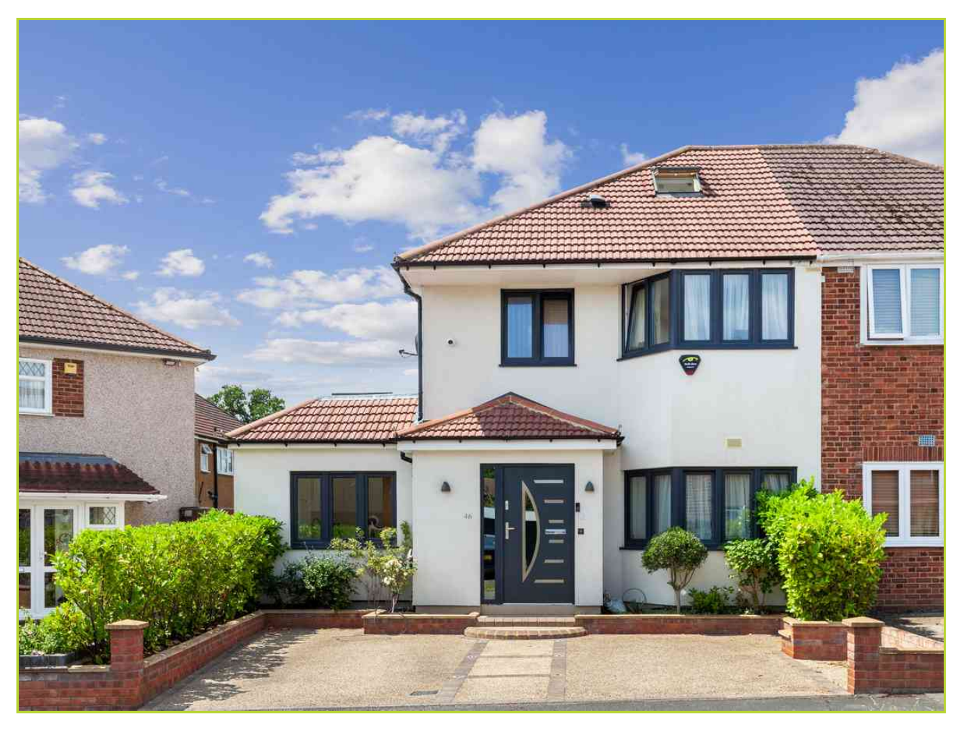
Craigweil Drive, Stanmore. HA7 4TU. £825,000 Freehold

A Well Extended 3 Bedroom Semi Detached Family Home set over 3 floors, offering spacious ground floor family living with a beautiful kitchen/dinner with bi-fold doors onto the west facing garden. Also, you have a formal reception room and utility room that could be converted into an additional study/bedroom. For those who need a home office/studio, the owners have constructed a fantastic garden room with an independent under floor heating system, sink, toilet and wash basin. On the 1st floor the main bedroom has an en-suite shower room/wc with an additional family bathroom. Off street parking for 2 cars. The property comes with 'smart' lighting and heating system controlled from your phone, other benefits include part air-conditioned and ventilation system. Located in this popular area being a short walk to Stanmore's Jubilee line train station and shopping facilities. Internal viewing is highly recommended.