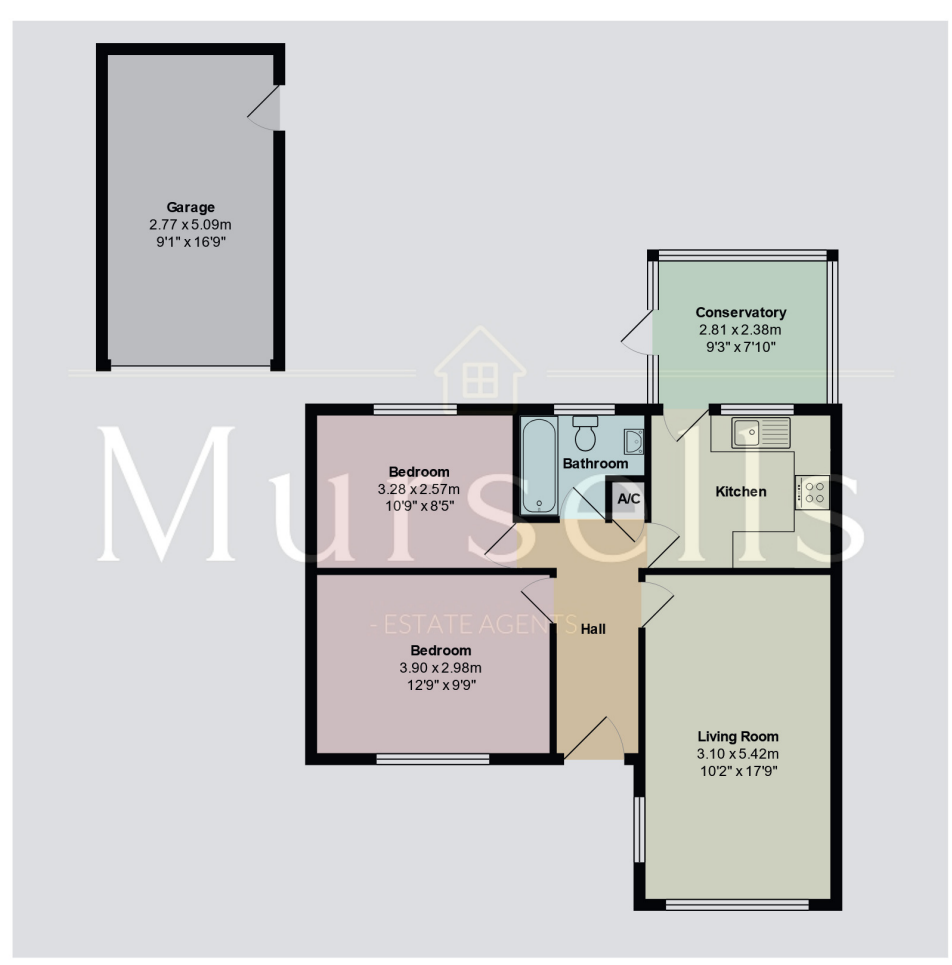
Total\ Area:\ 64.0\ m^2\ ...\ 689\ ft^2\ (excluding\ garage) All measurements are approximate and for display purposes only