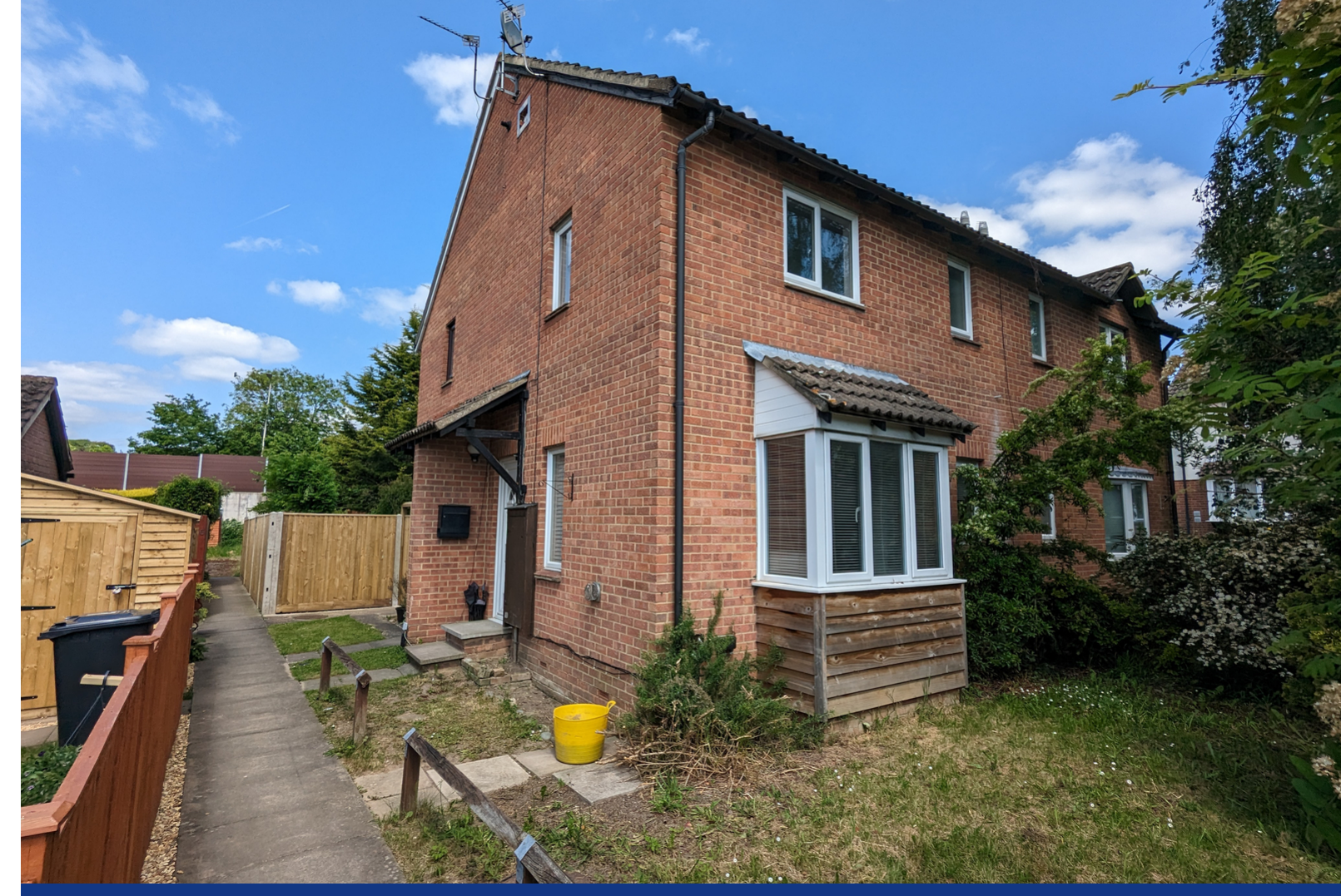
Caistor Close, Calcot, Reading.