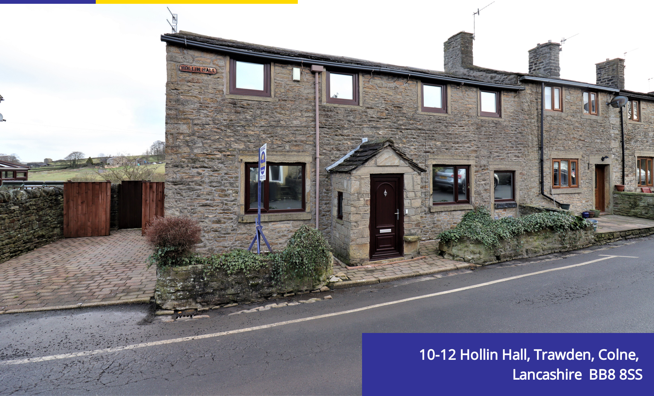
10-12 Hollin Hall, Trawden, Colne, Lancashire BB8 8SS